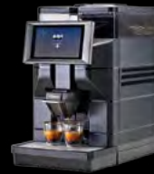
Magic B2 / B2+