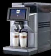
Magic M2 / M2+